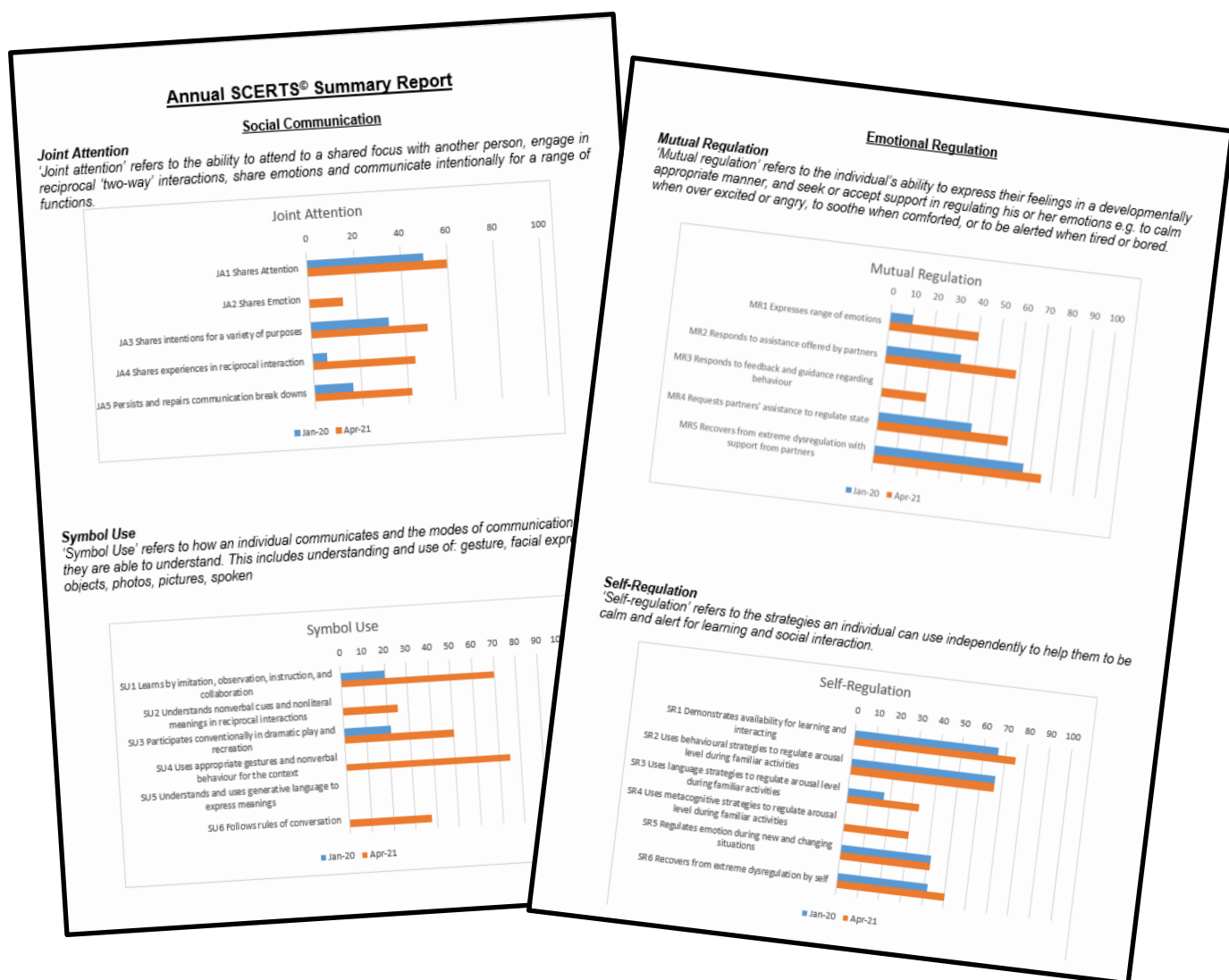
Figure 2. Exemplar of a SCERTS ® Annual Review Summary Report

Wide variation in the needs of our pupils means there is no one standardised measure that is appropriate for all pupils, or even for the same pupil at different points in their development. This difficulty is being addressed through RLS's use of the published, evidence based, SCERTS ® framework, which provides an observational assessment process that is relevant to all pupils and enables progress to be tracked from baseline to the time a pupil leaves Radlett Lodge (see Figure 2).